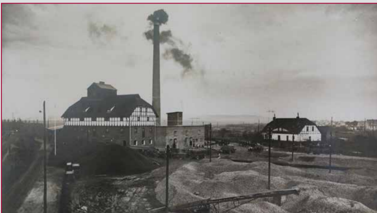
Potato flake factory around 1935 before the fire