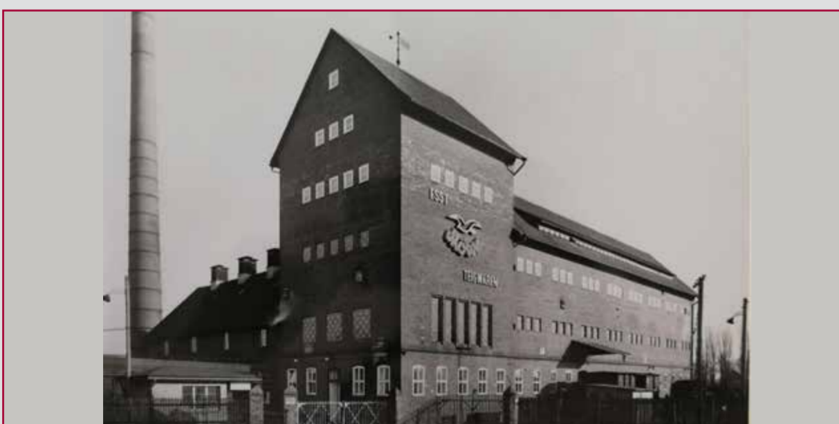
Despite the on-going war, the factory managed to rebuild within a year of the fire, complete with the most modern technology