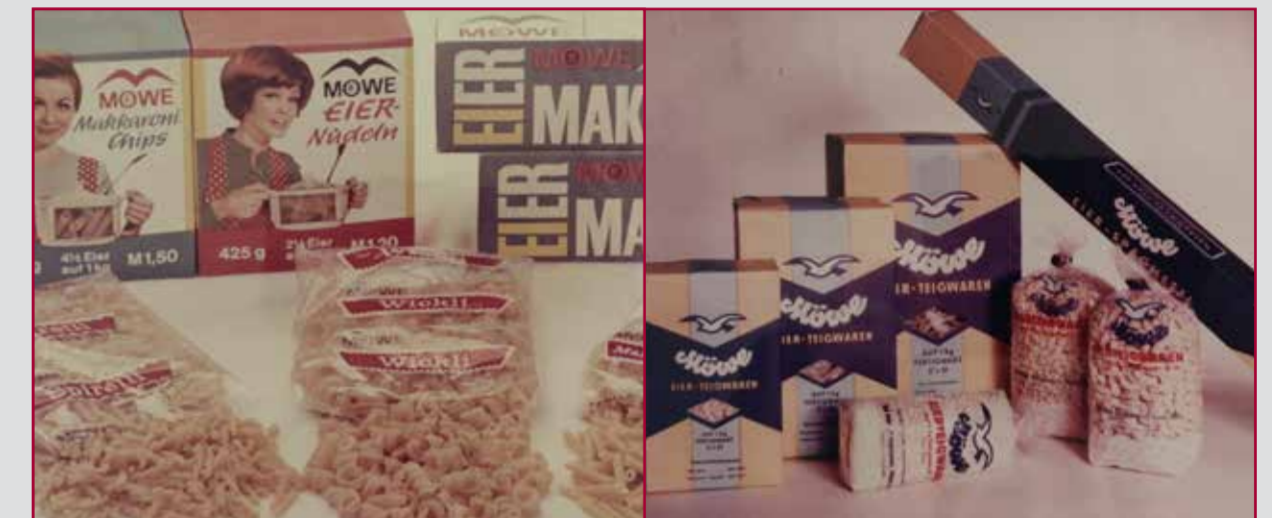
1 in 4 packets of pasta in former East Germany was „Möwe“ brand

Today, „Möwe“ produces pasta, organic products and baby foods which are delivered to every corner of Germany. Specially tailored product ranges are also still delivered to Scandinavian countries, like Finland and Sweden, the Baltic region, Indonesia, and even African and Middle Eastern countries.