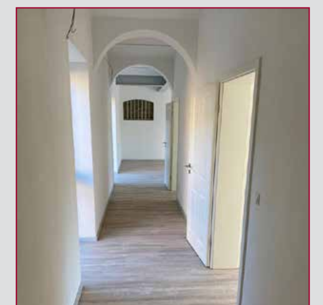
Corridor in the „Old Prison“ before and after the conversion in 2021