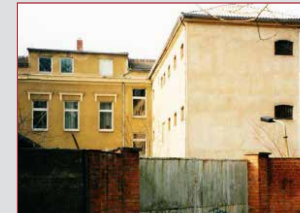
The old prison was surrounded by high walls