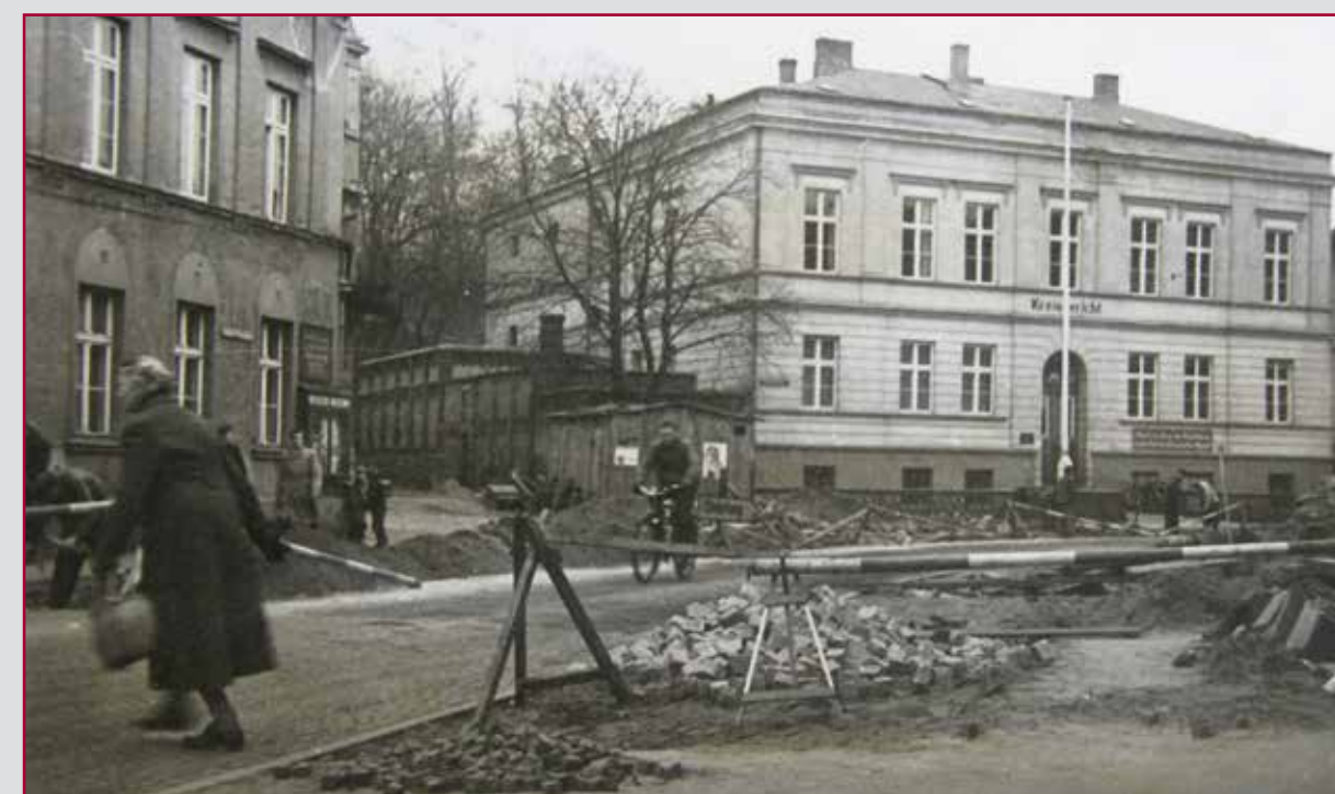
View of the courthouse around 1958

The district court building receives a fresh coat of plaster. The façade and roof are also simplified. The semi-arch adorning the top of the central risalit with the coat of arms of Mecklenburg disappears, as does the Lady Justice that was stood atop it. The house is coated with an ivory shade of lime sandstone. The iron fence running along Güstrower Straße is scrapped and replaced by a lower fence.