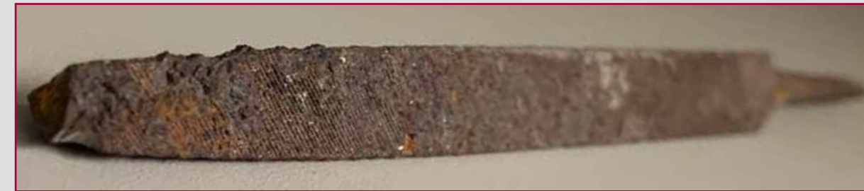
This arrow was found in an old cell during the building works. It was quite likely intended to be used as a means of escape.