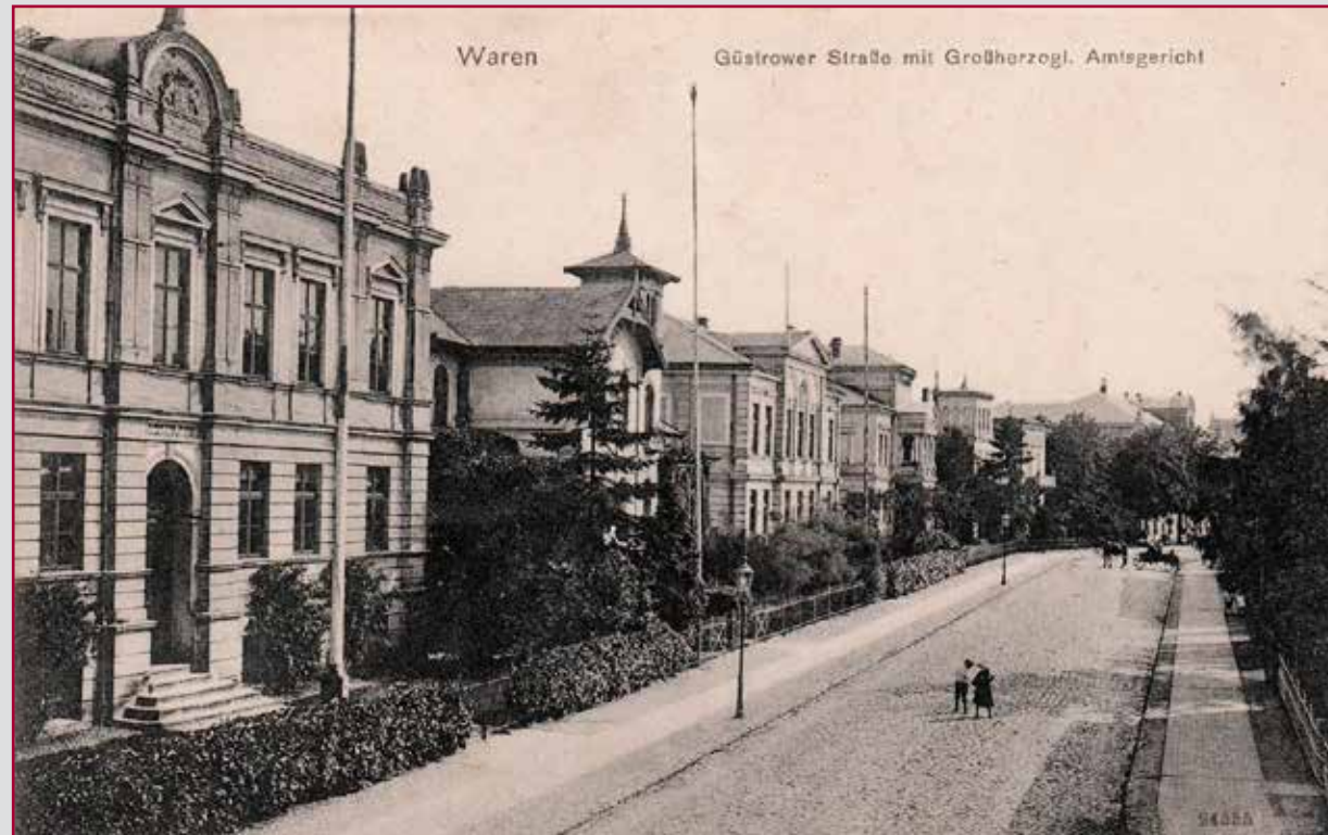
Looking down what is today Güstrower Straße around 1910